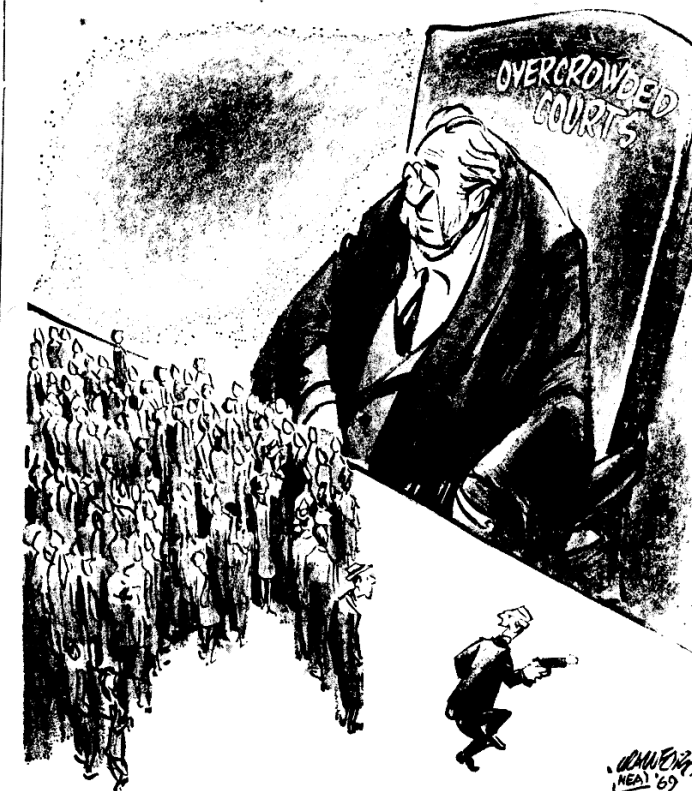
'SAVE MY PLACE—I'M GOING OUT TO LUNCH'

I think many of us are sick of Joan Baez and the motley crew which spend their time cluttering up the streets protesting