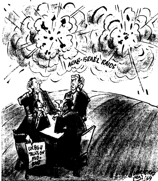
"Can't Hear a Thing With All That Racket!"

As a suggestion, let the council slap a tax on the aforementioned parties for the protection that they enjoy without loss of profit. I suppose the visiting police and firemen were not needed on their own job at home or else they were doing a little