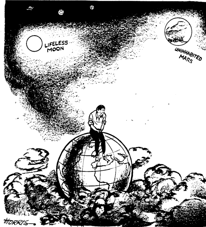
SUDDENLY IT SEEMS SO LONELY!

As Mr. Gun Owner says: What are you going to do when a robber breaks in, wave a $10 bill? Times have changed. Even you liberals know that.