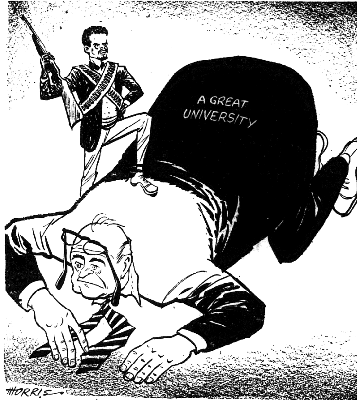
THIS IS AMERICA?