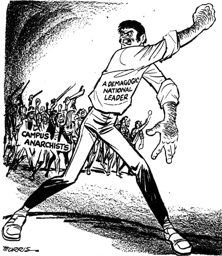
GREAT OPPORTUNITY FOR THE WRONG MAN!

It's a shame the spirit of patriotism is