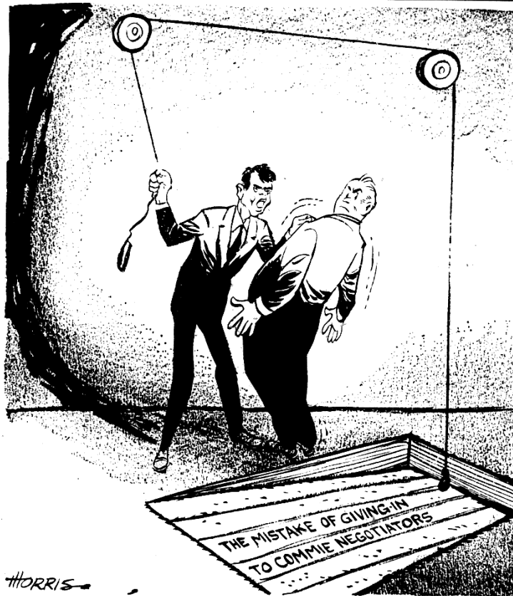
THAT OLD PANMUNJOM TECHNIQUE!

Then there's the cost, eventually, in taxes to support welfare programs for educationally deprived adults who are the result of the