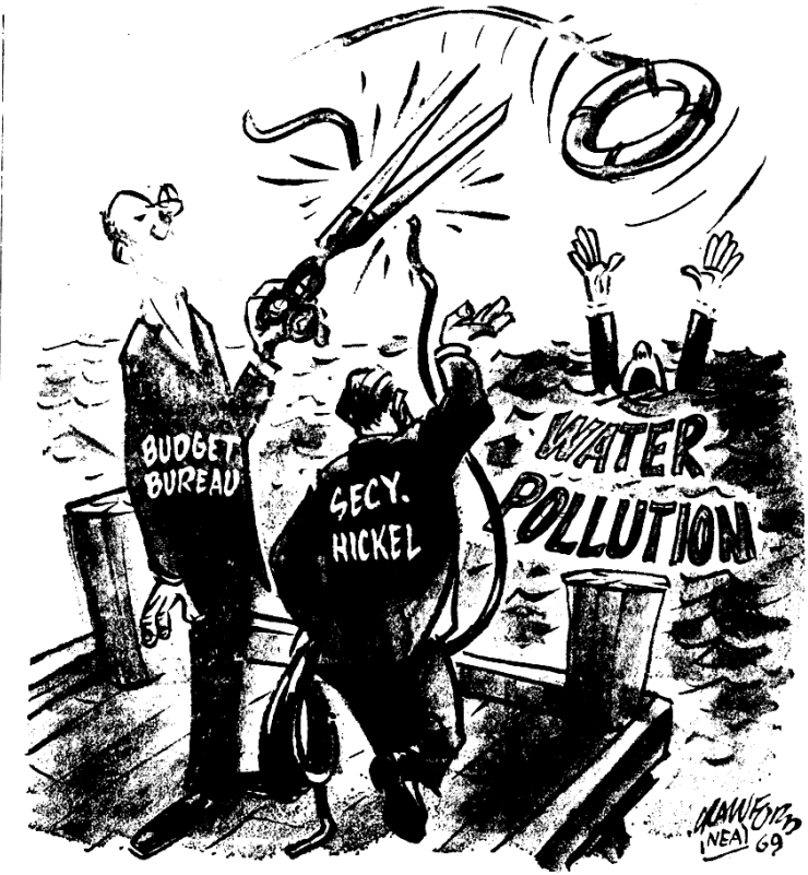
TO THE RESCUE!

The Black Panther Party recognizes this, and we say that the people of America must have free will, and that we all suffer at the same hands of the oppressor. We recognize that this capitalistic government has pushed the people up against the wall. The only way to remedy this is to resist — you have no other choice! We all know, or should know, that there must be a change in this society. The reasons for change are here, and they are chiefly due to the development of the internal