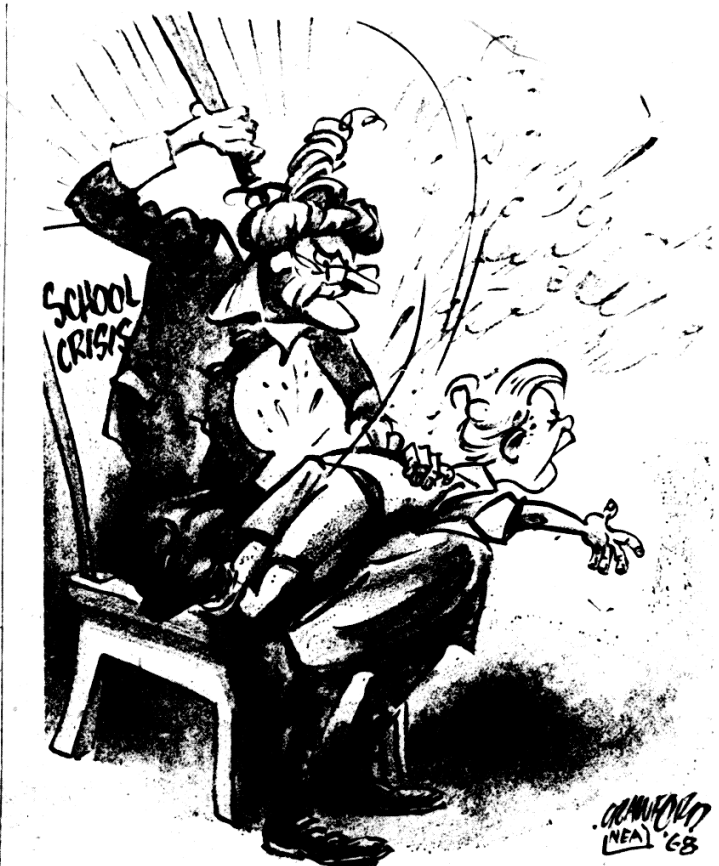
Taught To The Tune Of The Hickory Stick!

Police and California Highway Patrolmen are constantly on the alert at the University of California in Berkeley. In Madison, Wis., it was imperative for the governor to call out