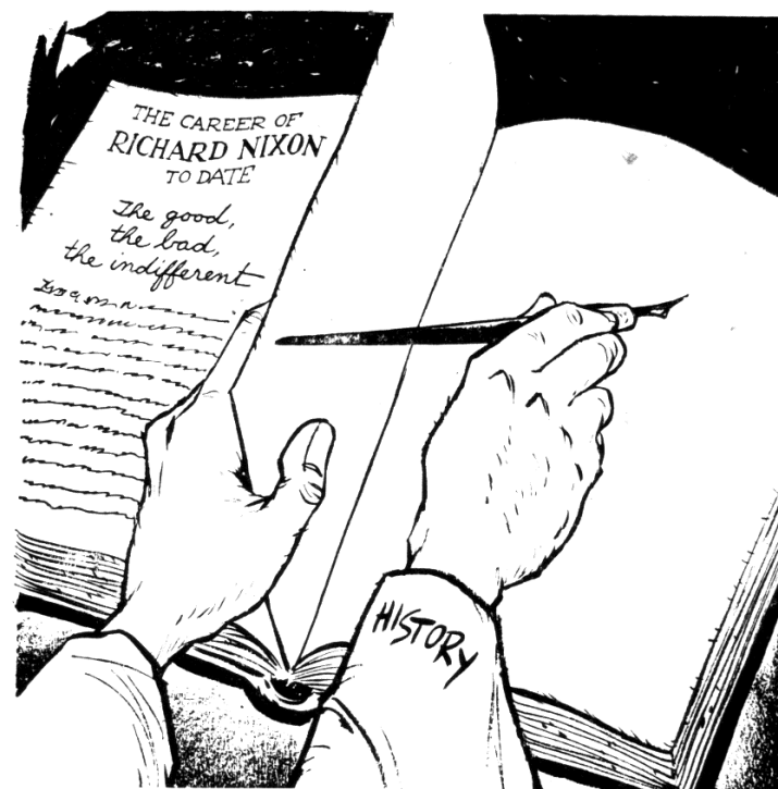
A BRAND NEW PAGE

Join our ideals of letting society, and mainly our parents, earn the bread so we can spend and eat it. Let the suckers build institutions so we can tear them down. After all, we can't get shot like we would if we tried it anywhere else! See, we have to be right