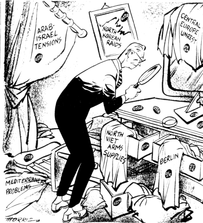
CLUES ALL OVER THE PLACE!