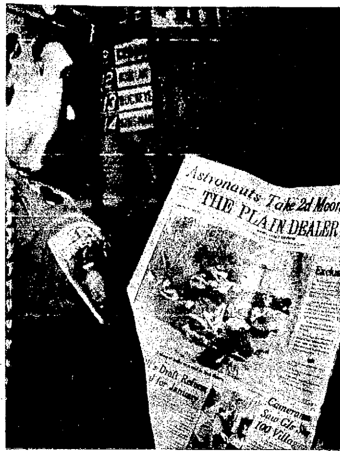
AN OFFICER training candidate in Cleveland examines pictures by former Army photographer Ronald Hachler, allegedly showing civilian victims of a U.S. massacre in a tiny South Vietnamese village, in March, 1968.

VOL. CXV—No. 321—Established 1854 EUREKA, CALIFORNIA, FRIDAY, NOVEMBER 21, 1969 Price Per Copy: Daily 10c—Sunday 20c ★ ★ 20 Pages Today