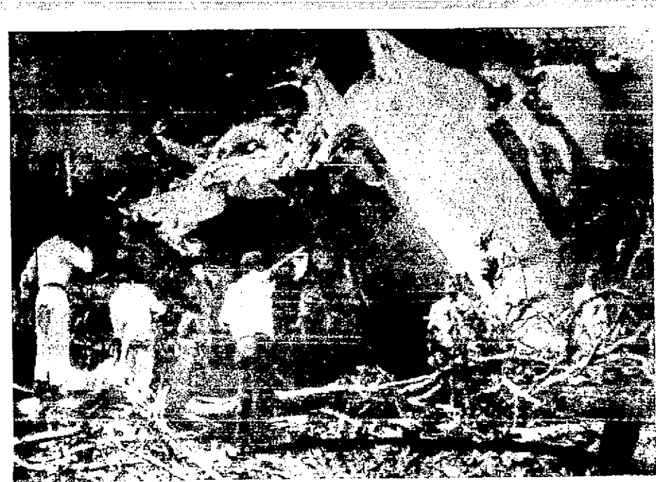
RESCUE WORKERS search through the wreckage of a Nigerian Airways VC10 jetliner which crashed near Lagos yesterday, claiming 87 lives. The plane was just 16 minutes from its scheduled landing on a flight from London. The charred, smoking wreckage lay in dense jungle just beyond the outskirts of the city.

HAYWARD (UPI) — A local ban on topless dancing went into effect Friday so two topless dancers applied to the state employment office for compensation. The office made no immediate ruling on their request.