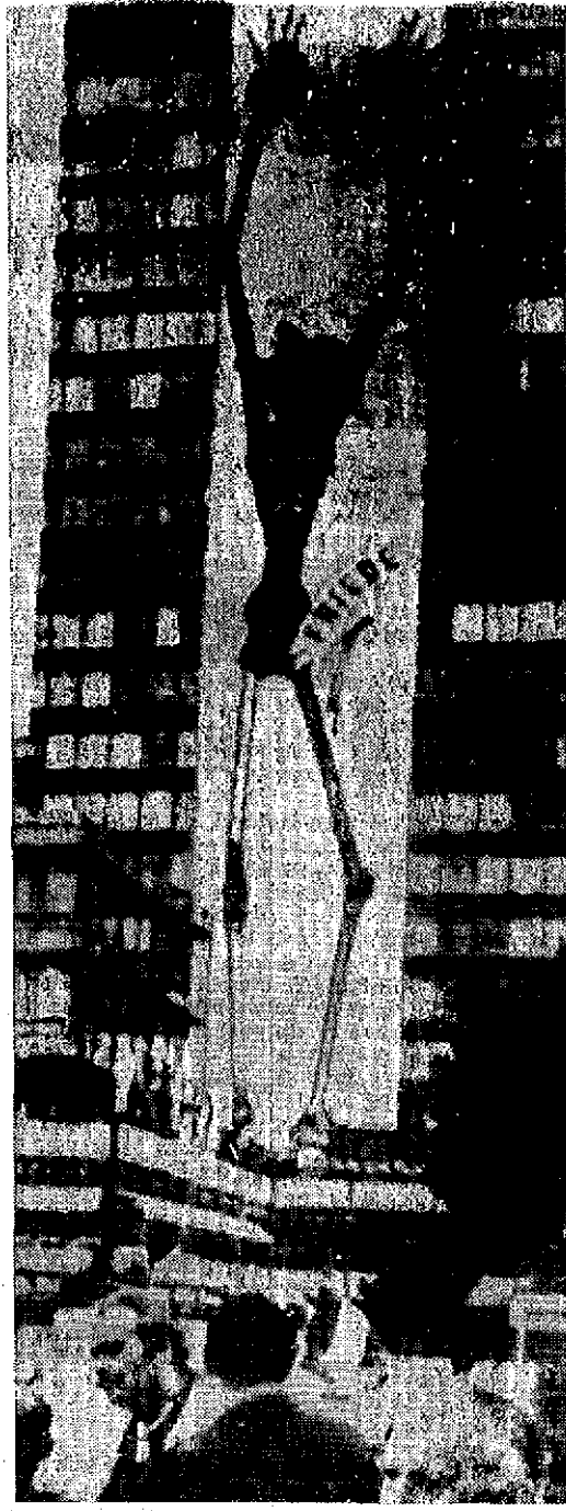
ELONGATED ART — People stand on street and look at 216-foot high painting by Michael Oswald Sunday in Berlin. The painting, titled "Suffering Mankind," hangs on the side of the 22-floor Europa Center and stretches from the first floor to the roof.

Security guards were searching the area around the compound in the Deer Lodge Valley. Dell said there were no immediate reports of stolen vehicles.